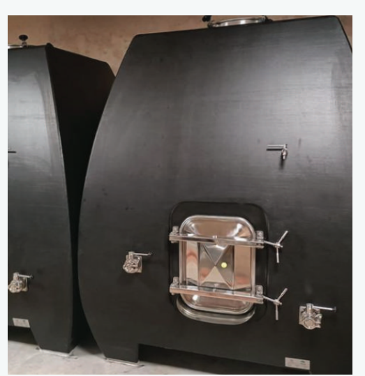
30 HL Crus.

A state of the art, computerized machine is used to accurately and consistently mix the right amounts of all necessary aggregates, cement, and water in order to guarantee a consistent and optimal mix of concrete across all tanks . For small standard tanks, the concrete is poured inside of molds and allowed to cure. For larger tanks, rebar and reinforced steel is used to provide structural support to the tank.