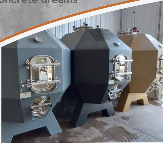
Two door diamonds in New York's Finger Lakes.

CLC Vasche, which stands for "Cooperative Lavorazione Cementi," is a family-owned and run company located outside of Padova in North Eastern Italy. CLC is a leading manufacturer for standard and tailor made concrete tanks for wine production, whose tanks can be found throughout Italy, France, Spain, South Africa and other important winemaking countries throughout the world.