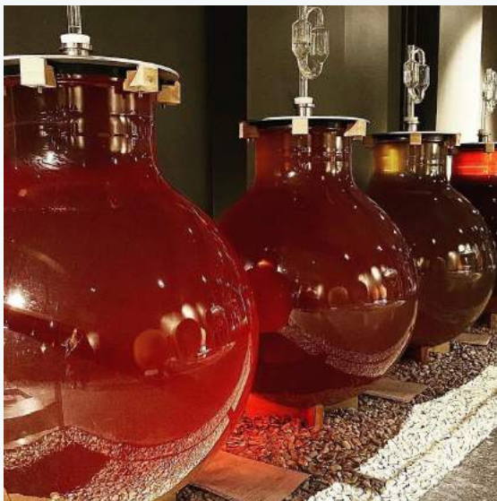
Wineglobes with the design stand at François Chidaine in the Loire.

Wineglobes have been shown to produce unique wines that are totally different to those fermented and aged in wood, concrete or steel vats. The natural features of the fruit, vineyard, and terroir are exposed in a way that is completely distinctive, unique and produces wines of purity and perfume. Wineglobes represent a unique tool to understand your terroir, vineyard and fruit in their purest forms and can be used interchangeably on all styles of white, rosé, sparkling base, skin contact or red wines. Due to the elimination of headspace, topping is not needed and SO 2 additions can be reduced by 25% to 50%.