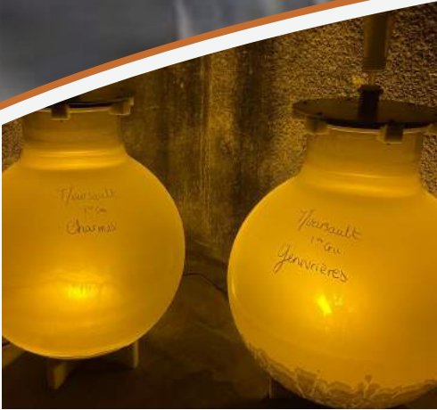
Meursault 1er Cru Charmes and 1er Cru Genevrières at Domaine Michelot in Meursault in Wineglobes.

Wineglobe, produced in Bordeaux France by the Paetzold family are single piece glass globes that range from 25L – 400L. The most popular sizes are the 115L and 220L which allow for the purest expression regarding terroir-driven wines. The Wineglobe was created in 2015 and in 2020 received the famous Vinitex Innovation Trophy award. Today, it represents the ultimate reference for a neutral, high end cutting edge vessel found in the most prestigious of cellars for the fermentation and aging of white and rosé wines and the aging of red wines.