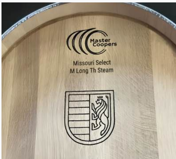
Master Coopers USA Missouri American oak barrel.