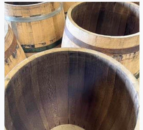
Master Coopers Produit de Bourgogne after a Slow Red Medium Plus Toast in Beaune Burgundy, Vincent's hometown.

Proprietary toast deepens and enhances finesse, elegance and length on French oak and decreases presence of whiskey lactones on American oak.