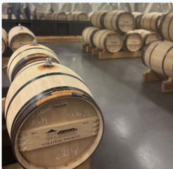
Maury Center of France French Oak, 3-Y Air Dry, MC2 (double light long toast) barrels at Château Talbot used both on whites and reds.

Maury barrels focus on fruit purity, expression, aromatics and structure. The barrels allow the fruit to remain in focus while providing lift and fullness. They are delicate enough for a lighter vintage but have enough personality and impact to excel in warmer vintages and richer wine styles.