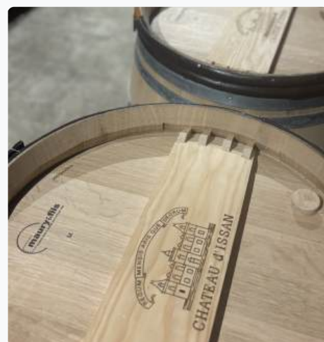
Maury Bordeaux Châteaux barrels with Center of France French Oak, 3-Y Air Dry, Medium Toast for Château D'Issan in Margaux.