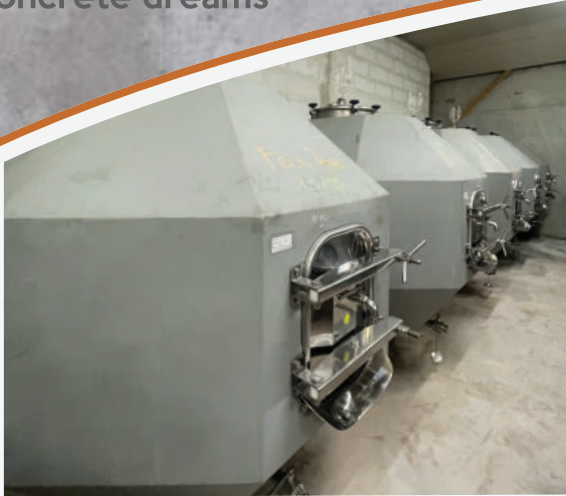
Two door 20 HL CLC Diamonds at Domaine du Gringet in France's Savoie.

CLC Vasche, which stands for “ Cooperative Lavorazione Cementi ,” is a family-owned and run company located outside of Padova in North Eastern Italy. CLC is a leading manufacturer for standard and tailor made concrete tanks for wine production, whose tanks can be found throughout Italy, France, Spain, South Africa and other important winemaking countries throughout the world.