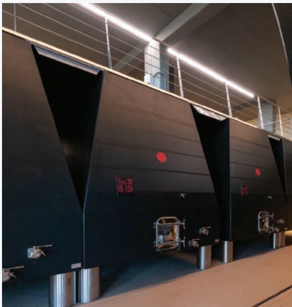
Line of Tronco tanks.

Mac Forbes, A.A Badenhorst, Stony Hill, Taylors, Amos Rome.