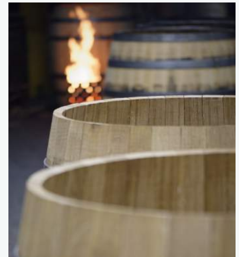
Barrels toasting at the cooperage in Bordeaux.

Maury barrels focus on fruit purity, expression, aromatics and structure. The barrels allow the fruit to remain in focus while providing lift and fullness. They are delicate enough for a lighter vintage but have enough personality and impact to excel in warmer vintages and richer wine styles.