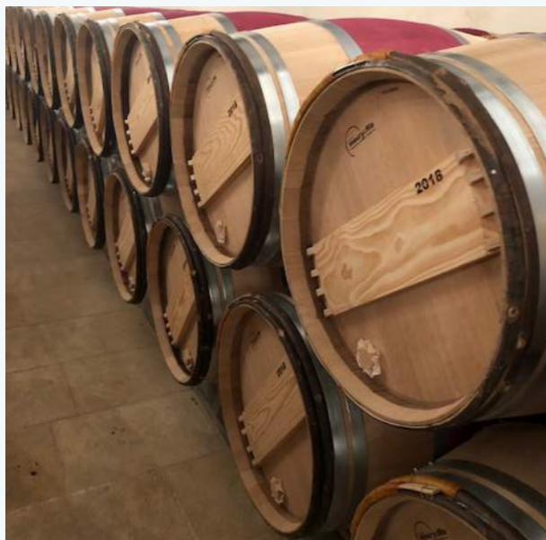
Row of Maury medium toast Bordeaux Chateau barrels at Château Léoville-Barton in St. Julien.