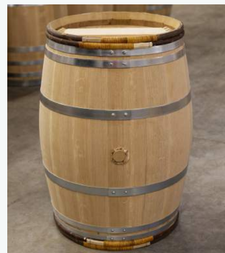
Finished 225L Bordeaux Château barrel.

Maury barrels focus on fruit purity, expression, aromatics and structure. The barrels allow the fruit to remain in focus while providing lift and fullness. They are delicate enough for a lighter vintage but have enough personality and impact to excel in warmer vintages and richer wine styles.