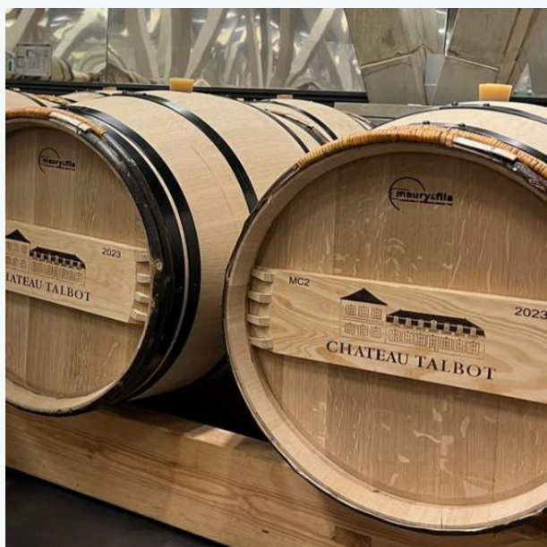
Maury MC2 toasted barrels at Château Talbot in St. Julien.