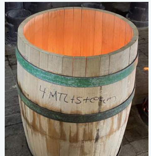
Master Coopers USA steam bent barrel.