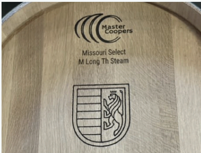
Master Coopers Missouri Select barrel ready to be filled.