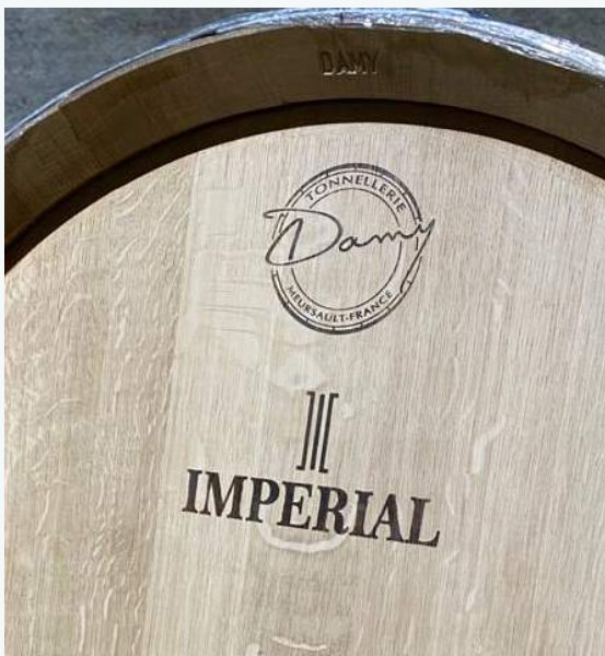
Damy Imperial barrel.