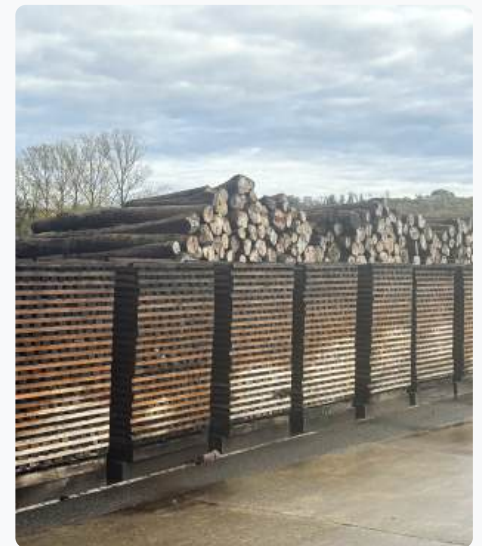
Canadell is fully vertically integrated from sourcing French oak logs to their premium French Oak adjunct product line.

The Canadell product line includes powder and chips for use during fermentation and post ferment aging, to dominoes and staves, which best showcase the qualities of French oak and show characters remarkably similar to barrel aging. Canadell bridges the gap between barrels and oak alternatives.