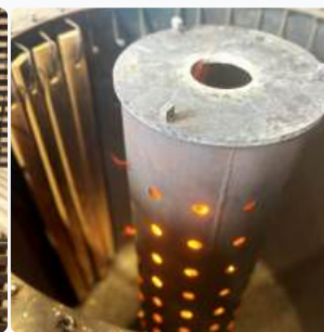
Fire-toasted staves done by hand over a live flame, just like toasting barrels.