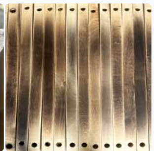
An assortment of different fire-toasted staves.