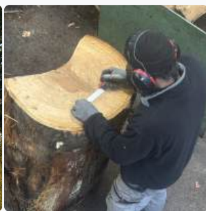
Technology and the human eye are used for log splitting.