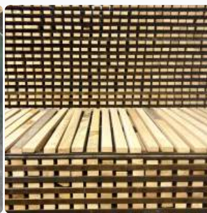
Convection toasted staves.