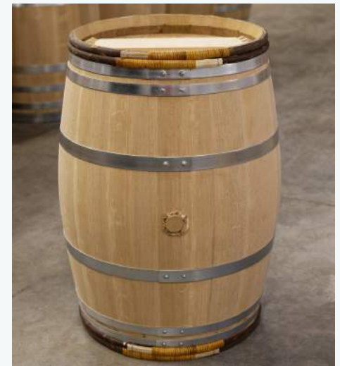
Finished 225L Bordeaux Château barrel.

Maury barrels focus on fruit purity, expression, aromatics and structure. The barrels allow the fruit to remain in focus while providing lift and fullness. They are delicate enough for a lighter vintage but have enough personality and impact to excel in warmer vintages and richer wine styles.