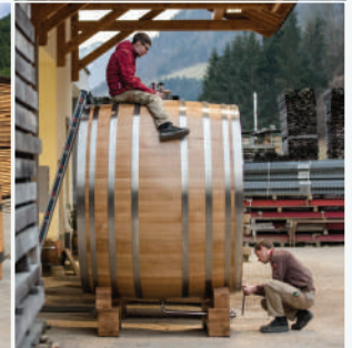
Final touches on an Oval.