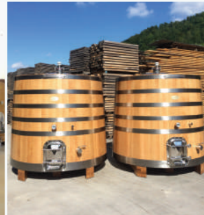
50 HL conical operating tanks.