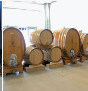
Schneckenleitner casks including 500L 45 mm puncheons.