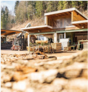
The Schneckenleitner stave mill where logs are received.

Schneckenleitner has built their reputation on the production of their large format ovals and puncheons which are found in many of Europe's finest cellars. Because of the large format, the incredibly long and low toast, and significantly long air-drying time results in extremely low impact ovals, rounds and puncheons that respect the wine's fruit, freshness and minerality, while allowing for some natural micro-oxidation to occur. Their large format vessels work both on white and red wines.