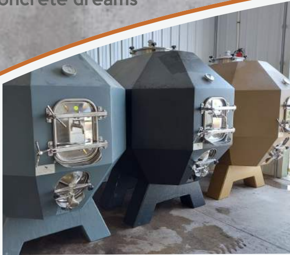
Two door diamonds in New York's Finger Lakes.

CLC Vasche, which stands for “ Cooperative Lavorazione Cementi ,” is a family-owned and run company located outside of Padova in North Eastern Italy. CLC is a leading manufacturer for standard and tailor made concrete tanks for wine production, whose tanks can be found throughout Italy, France, Spain, South Africa and other important winemaking countries throughout the world.