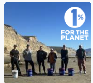
Bouchard Cooperages annual 1% For the Planet Commitment of cleaning up trash at Drake's Beach.