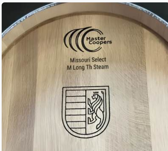
Master Coopers USA Missouri American oak barrel.