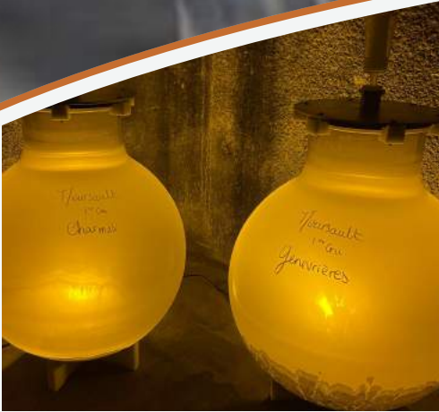
Meursault 1er Cru Charmes and 1er Cru Genevrières at Domaine Michelot in Meursault in Wineglobes.

Wineglobe, produced in Bordeaux France by the Paetzold family are single piece glass globes that range from 25L – 400L. The most popular sizes are the 115L and 220L which allow for the purest expression regarding terroir-driven wines. The Wineglobe was created in 2015 and in 2020 received the famous Vinitex Innovation Trophy award. Today, it represents the ultimate reference for a neutral, high end cutting edge vessel found in the most prestigious of cellars for the fermentation and aging of white and rosé wines and the aging of red wines.